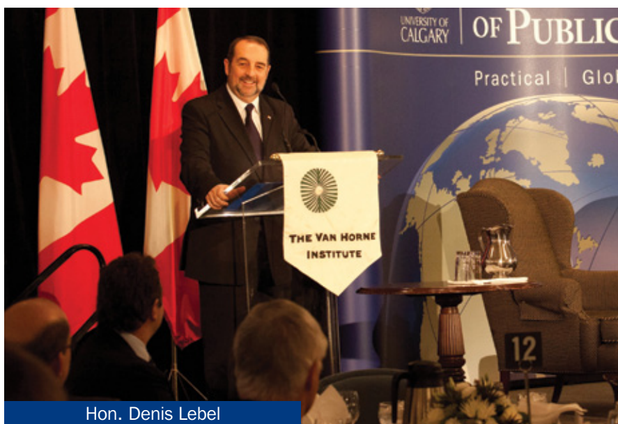
Hon. Denis Lebel

Two papers were presented at this roundtable devoted to energy taxation. The research – Capturing Economic Rents from Resources: Optimizing the Structure of Government Revenues Through Royalties and Taxes and Federal-Provincial Dimensions of Resource Taxation in Canada – fueled discussion amongst academics and members of the private and public sectors.