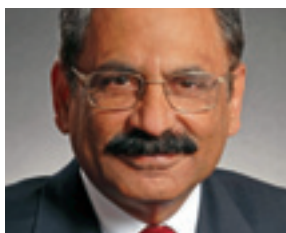
Munir Sheikh, Executive Fellow Former Chief Statistician of Canada and former Deputy Minister of Labour for the federal government