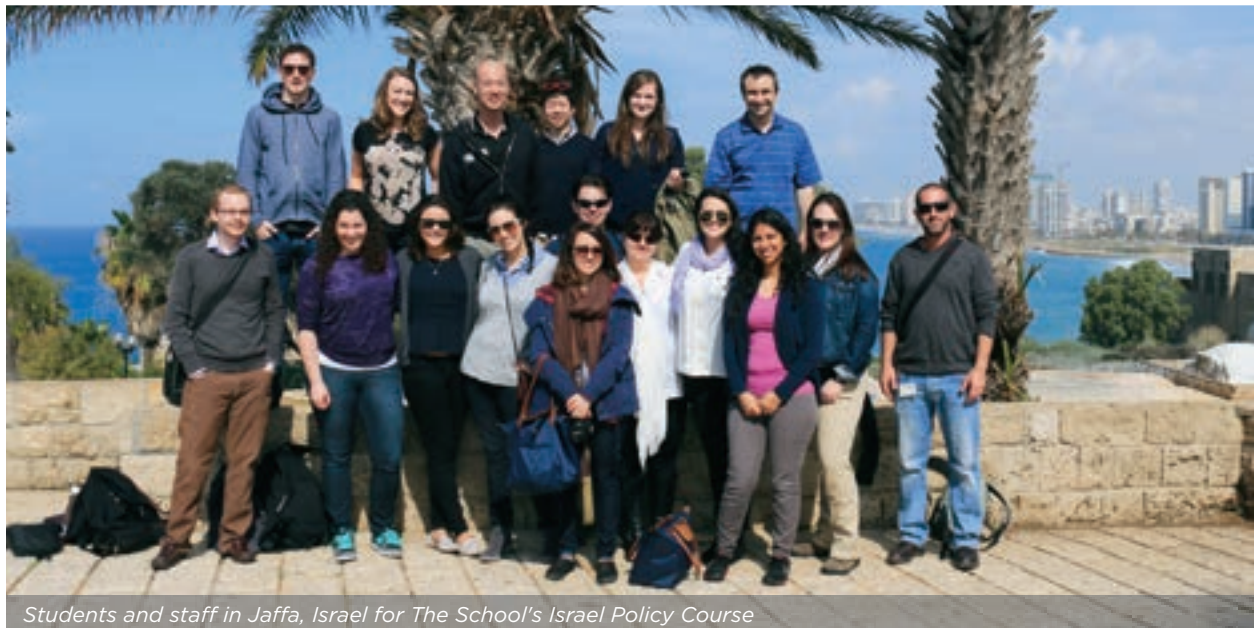
Students and staff in Jaffa, Israel for The School's Israel Policy Course

September 2013 saw the third cohort of students enter the Master of Public Policy program. The calibre of students entering the program was the highest to date in terms of grade point average, with this year's average entrance GPA at 3.7. The class of 2014 is made up of students from across Canada and countries around the world, including Liberia, Malawi and Ecuador.