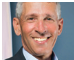
Robert Fonberg Executive Fellow Former Deputy Minister of National Defence; Expertise in global and regional economics, trade, and security and cyber issues