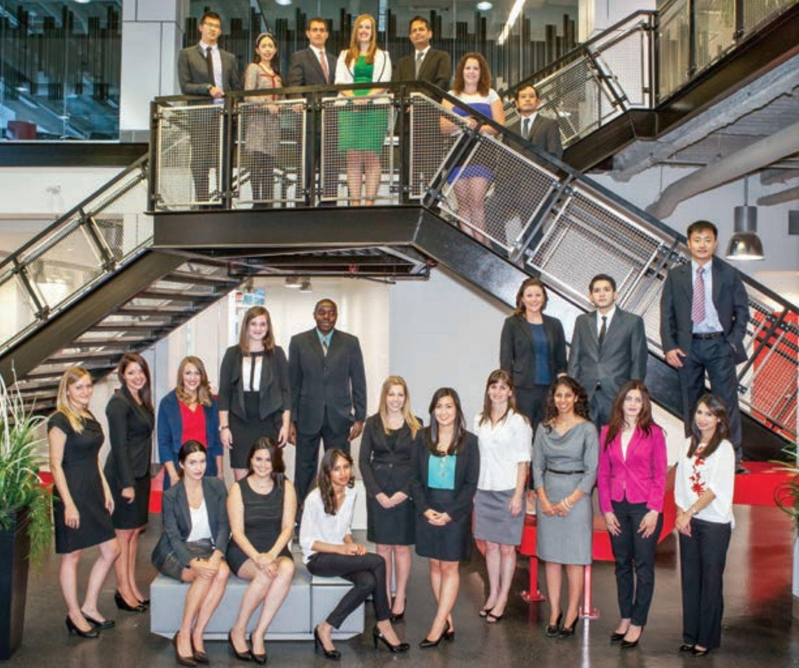
Master of Public Policy Class of 2013