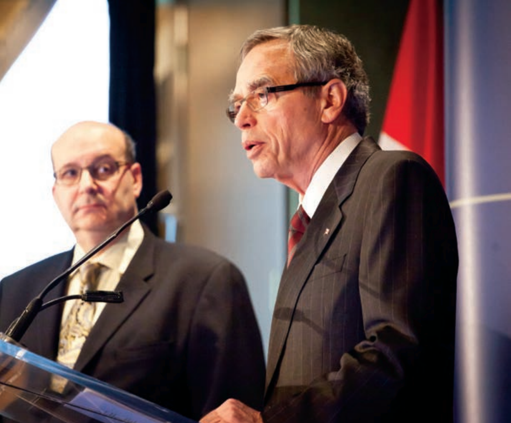
Hon. Joe Oliver, Minister of Finance, and former Minister of Natural Resources, Government of Canada