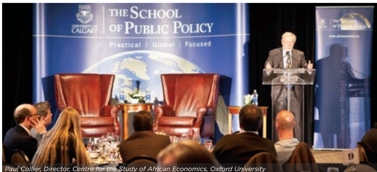
Paul Collier, Director, Centre for the Study of African Economies, Oxford University