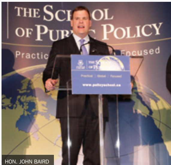
HON. JOHN BAIRD

Building on this success, the International Economics Program will produce new initiatives that capture an even broader range of policy topics promoting Canada's ascension in the world economy. Specific areas of investigation will include trade, investment, immigration, tax and financial market regulation. These efforts will be facilitated by the working relationships The School has established with the International Monetary Fund, World Bank and the International Tax and Investment Center.