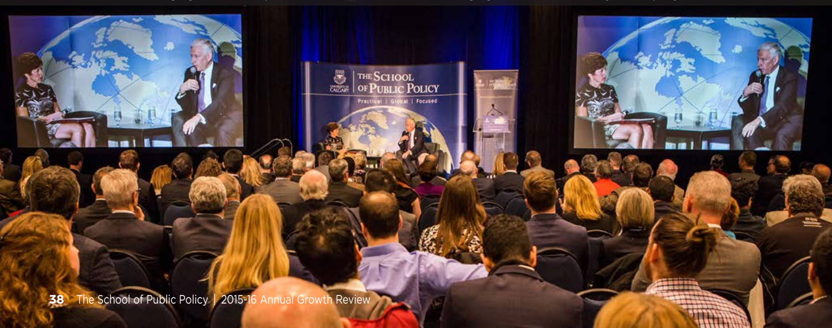
Global Forces and a Changing World and speaker Dominic Barton, Global Managing Director of McKinsey & Company