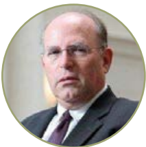
Uzi Arad Executive Fellow

Former National Security Advisor to Israeli Prime Minister Netanyahu