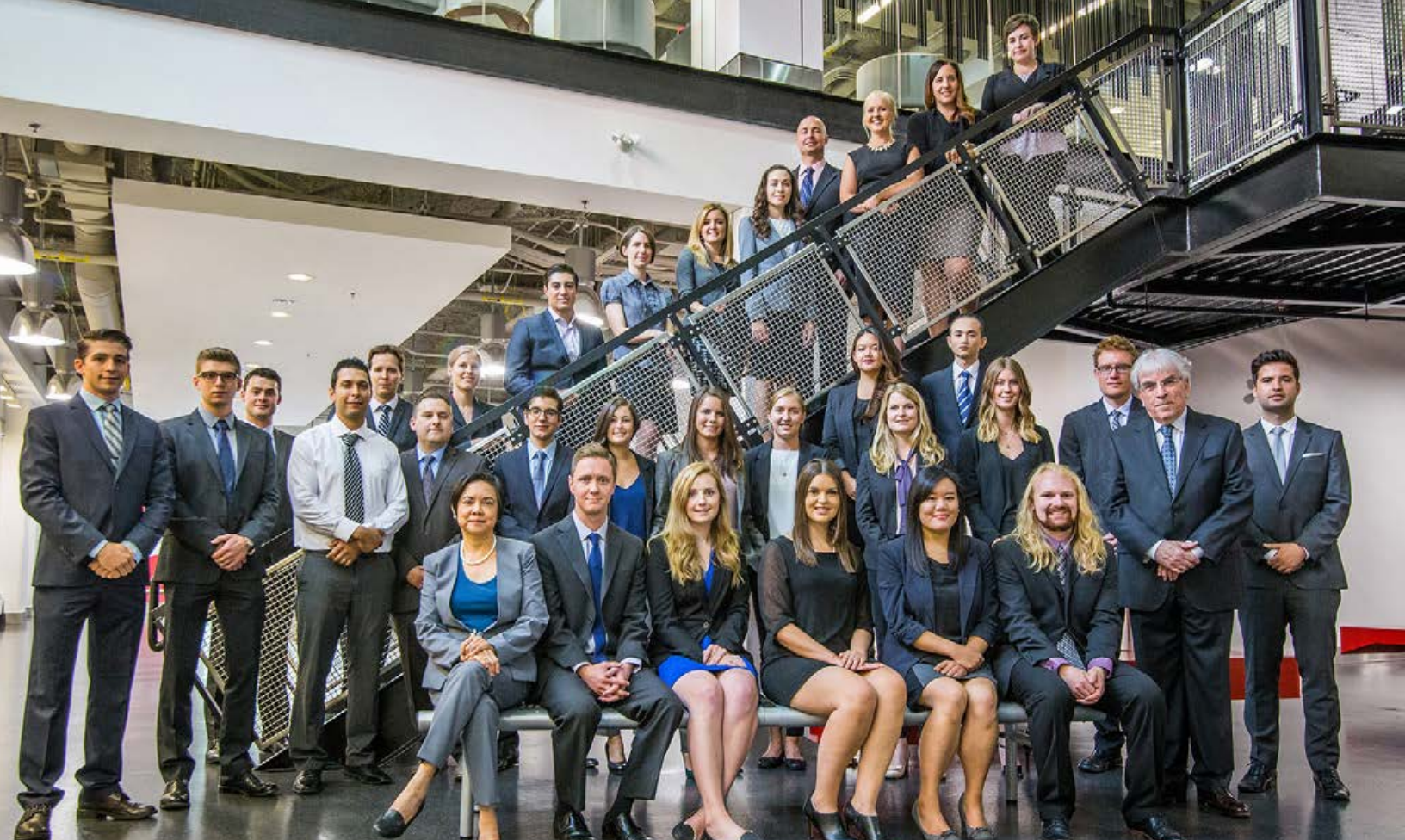
Master of Public Policy class of 2016