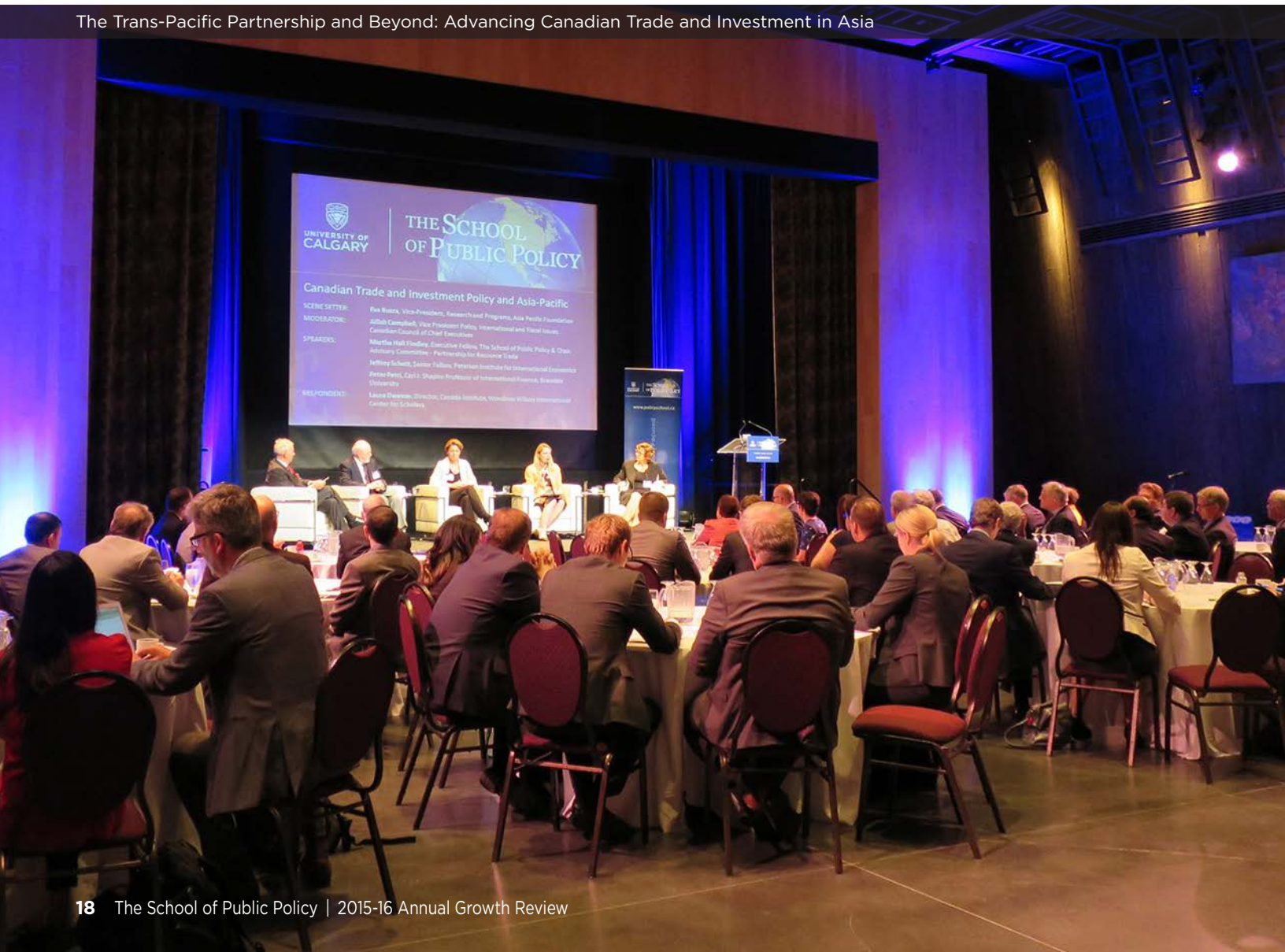
The Trans-Pacific Partnership and Beyond: Advancing Canadian Trade and Investment in Asia

Third annual symposium in partnership with the Canadian Global Affairs Institute.