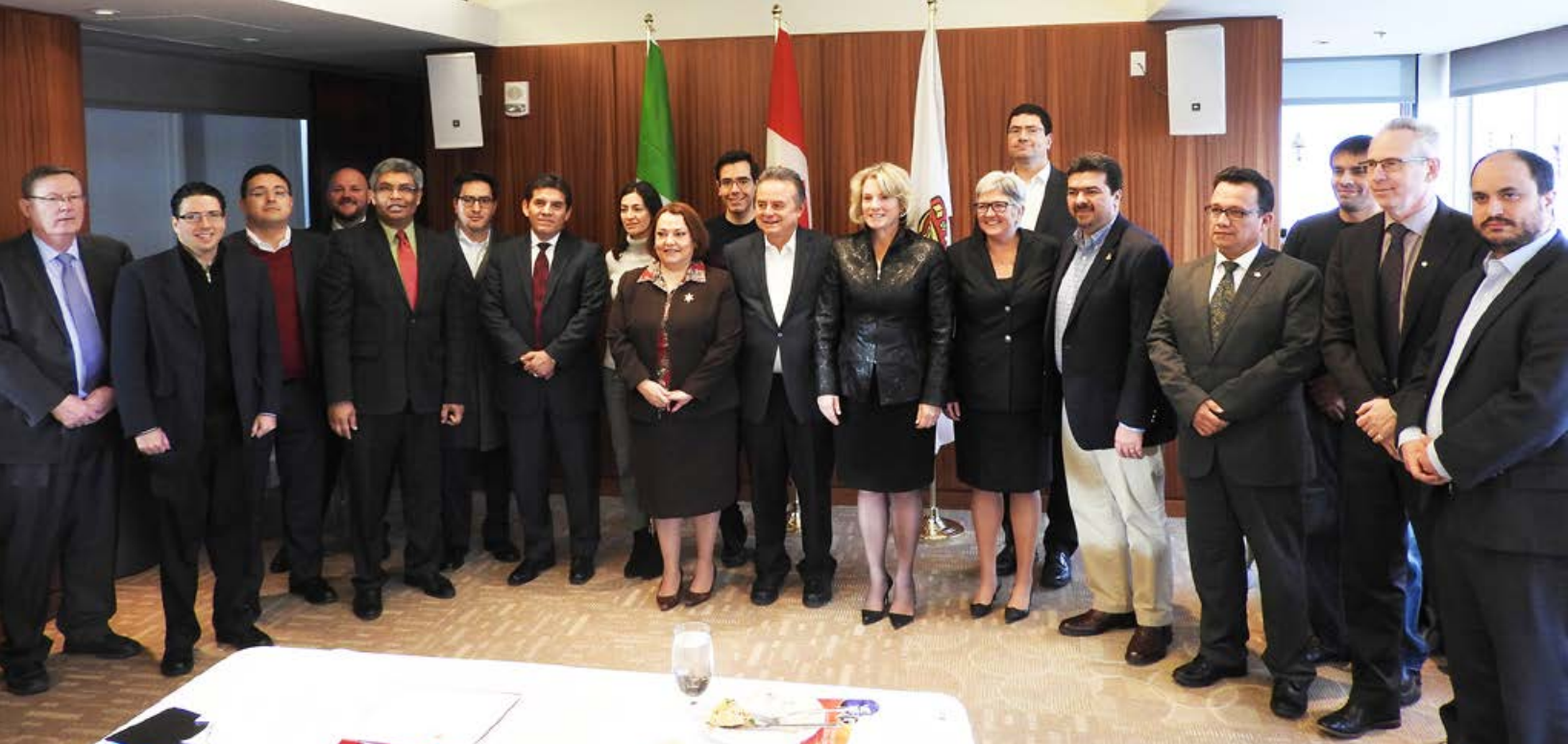
University of Calgary recently hosted a Mexican delegation led by Pedro Joaquín Coldwell, Secretary of Energy, Mexico Ministry of Energy (SENER).