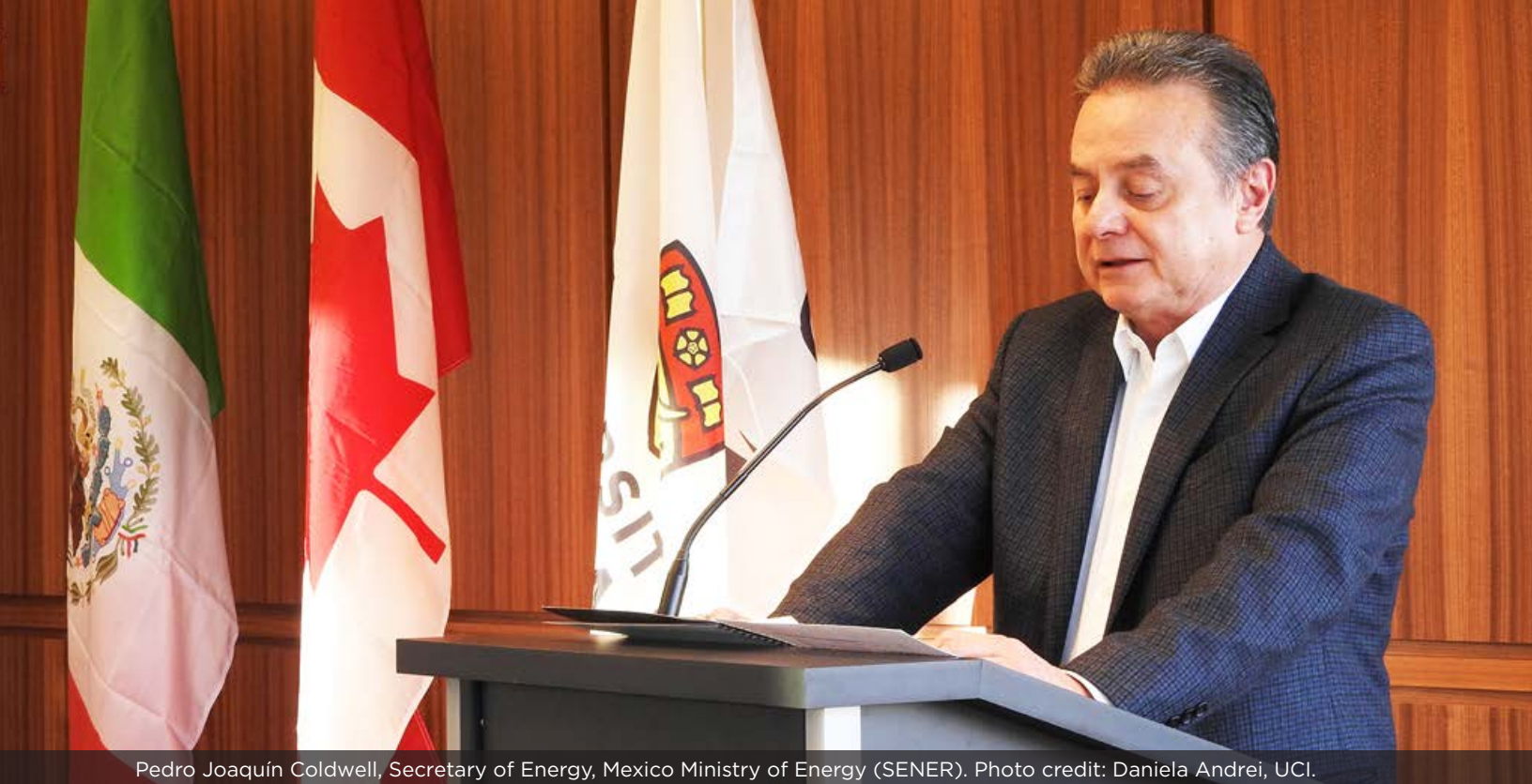
Pedro Joaquín Coldwell, Secretary of Energy, Mexico Ministry of Energy (SENER).

support the general public through the financing of infrastructure, public services, employment, etc.