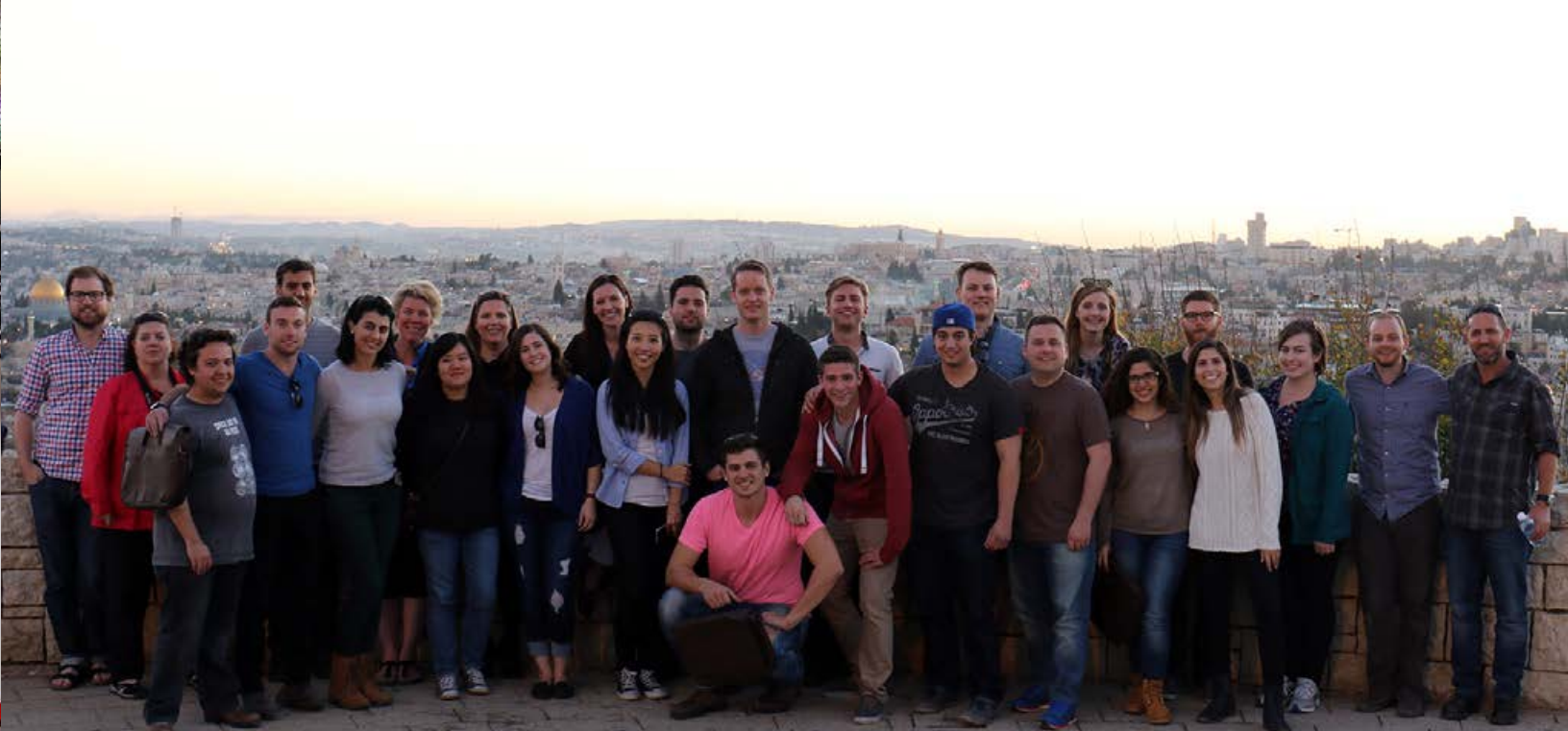
The 2016 Israel Program students

“In addition to obtaining a newfound appreciation for the special bond that Canada and Israel share, we gained insight and perspective into the complexity and scope of many of the geopolitical, cultural and social issues in Israel, and into the diversity of people working to solve them.”