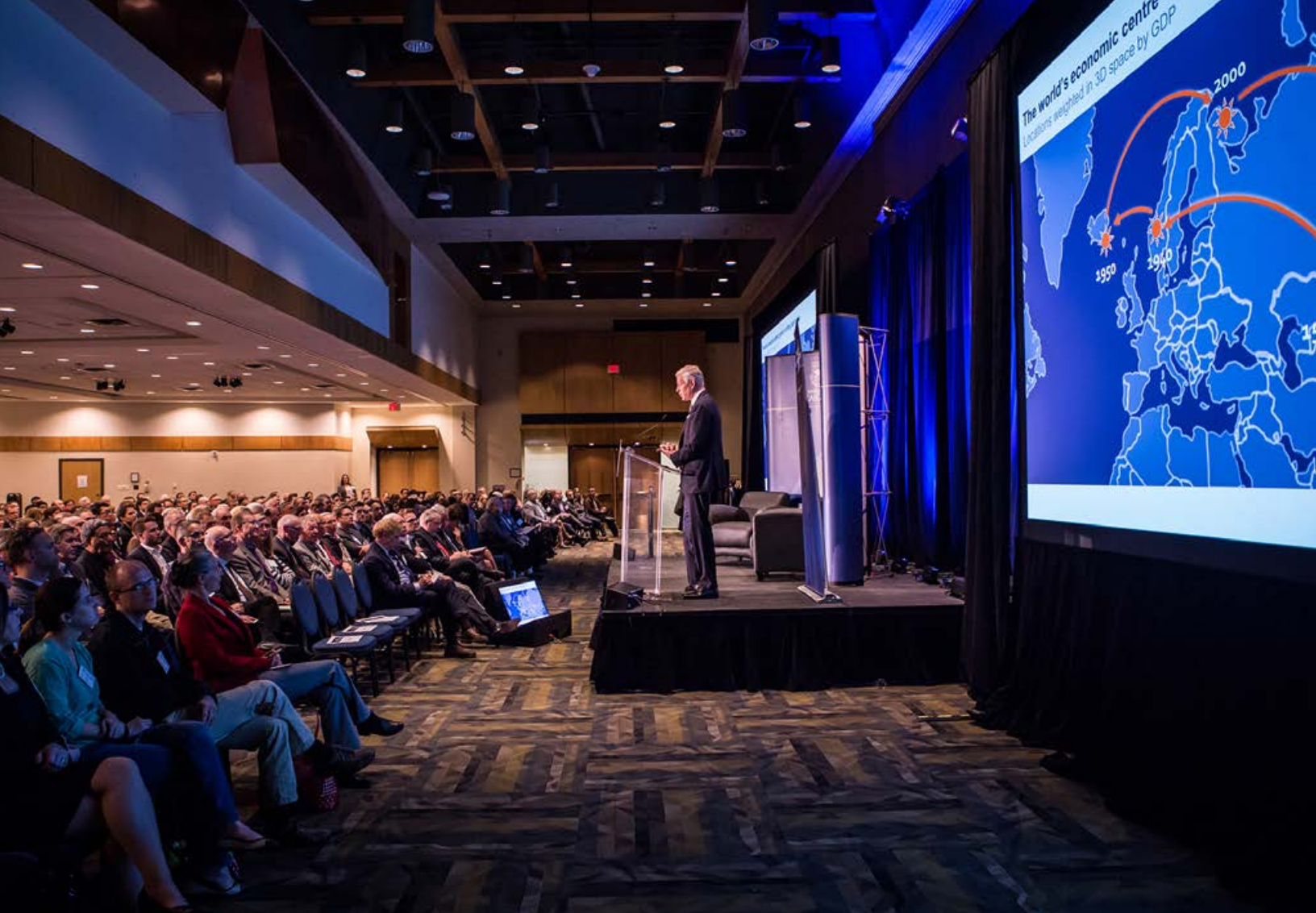
Global Forces and a Changing World