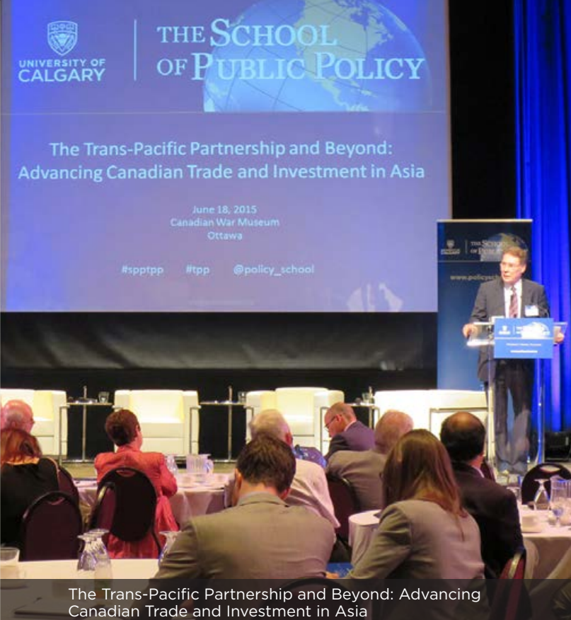
The Trans-Pacific Partnership and Beyond: Advancing Canadian Trade and Investment in Asia