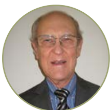
Charles McLure Executive Fellow

Former Chair and CEO of the Energy Resources Conservation Board in Alberta; former Deputy Minister of Energy