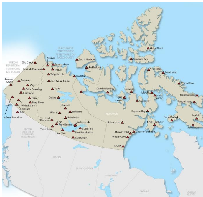
The patrols of the 1 st Canadian Ranger Patrol Group are located throughout the Yukon, the Northwest Territories, Nunavut and Atlin, B.C.

Strengthening the Rangers has been one of the key elements of the CAF’s drive to enhance overall capacity. The force’s numbers have been expanded, new equipment issued, and a new rifle chosen to replace the traditional Lee-Enfield. 1CRPG has also moved beyond its traditional areas of operation by undertaking extended patrols and training exercises. 38 Operations Nunavut and Nunakput , for instance, have seen the Rangers deploy on lengthy expeditions to demonstrate capability and practice working with other elements of the CAF and OGD. Alone, the Rangers represent one leg of the CAF’s domain awareness. When deployed with regular forces or southern-based reservists, they serve as force multipliers, increasing the effectiveness of any deployment by teaching, guiding, and generally keeping others alive and active. 39 After-action reports from Army exercises repeatedly highlight the benefits of this partnership and the need to leverage the Rangers’ knowledge and capabilities to facilitate operations and further develop the Army’s northern skills. 40