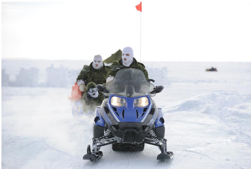
The ARCG advances to the next position during Exercise Guerrier Nordique in Iqaluit on March 5, 2014

The essential capability provided by the ARCGs and the upgrading of the Army's basic skills is as crucial as it is unsexy. They are not intended to engage in combat operations in the Arctic and, apart from the occasional photo-op during exercises, they were not designed as dramatic displays of Canadian sovereignty. Rather, they provide the CAF with options when responding to a wide variety of scenarios. As mentioned earlier, Exercise Northern Bison (2008) revealed that most soldiers would be a liability if sent north – meaning that keeping them alive would consume all of their own energy, plus that of others. Current Arctic training is designed, first and foremost, to minimize the amount of effort required for a unit to sustain itself in order to maximize the energy available to provide support. 34 The ARCGs were built to be inserted wherever needed to provide Canada with a basic Arctic presence, not in the traditional flag-waving sense of the word but as a versatile all-purpose force capable of providing support across the security spectrum.