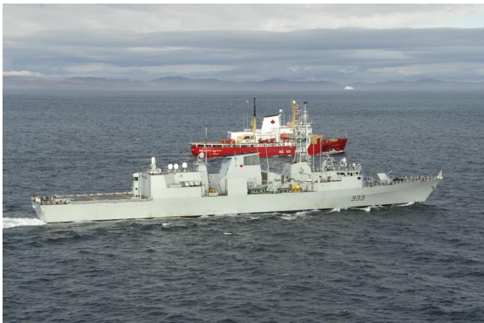
The HMCS Toronto and CCGS Pierre Radisson in Hudson Strait off the coast of Baffin Island during Operation Nanook 2010

As such, some of the CAF's most expensive new procurements are intended to develop a genuine Arctic capability for the RCN. First amongst these is the Arctic Offshore Patrol Ships (AOPS). Announced in July 2007, the AOPS are intended to increase the Navy's ability to operate across the Northwest Passage, support other CAF units, and assist OGD in carrying out their mandates. 48 The Navy's guiding policy statement, Leadmark (2001), assumes that traffic along the Northwest Passage will continue to increase and that the government's responsibilities will grow accordingly. As is the case in Army projections, these responsibilities are connected to unconventional security threats, like criminal activity and smuggling. 49