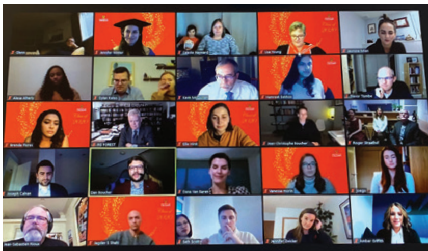
2020 MPP Grads